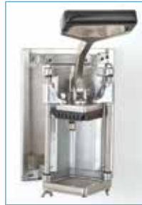
Wall mounted with HFC-BK