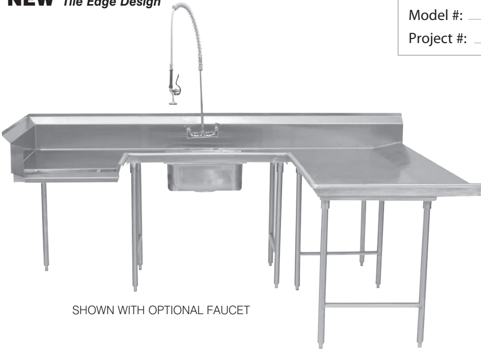
SHOWN WITH OPTIONAL FAUCET